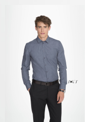
BARNET MEN 01428